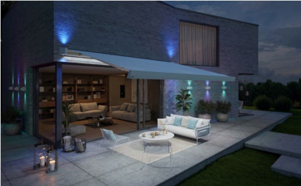
Cool and clear – and, with an app, all the colours in the world.