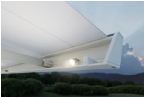
LED Spots in the front profile Showcase designated areas selectively and charmingly.