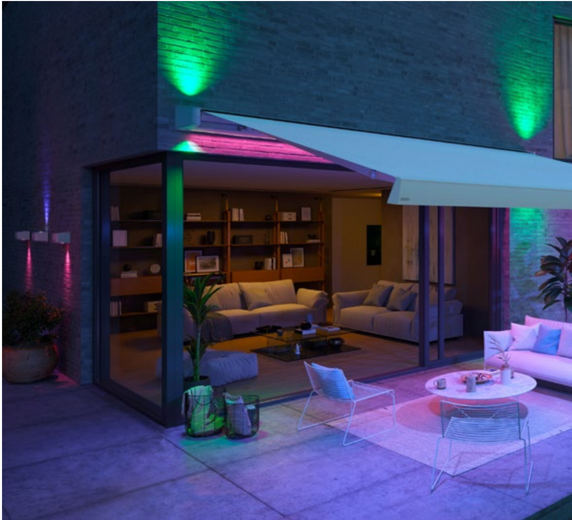
Bright and colourful for a memorable party with friends.