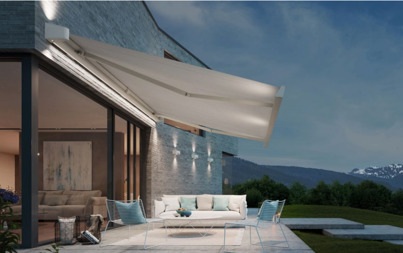
The later the evening, the more beautiful the light. Innovative LED lighting technology extends both the outdoor living space and the amount of time you can spend outside.