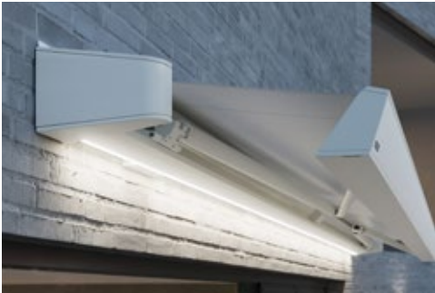
LED Line in the cassette Accentuates the design of the awning and creates a fascinating atmosphere.