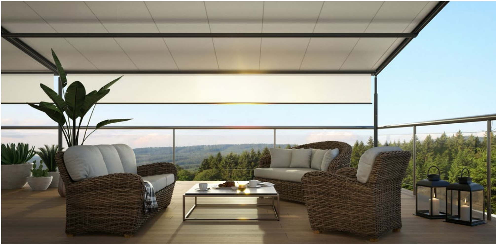
markilux shadeplus The vertical protection against sun and prying eyes – up to 230 cm in height – creates a private room outdoors with its own special ambience.